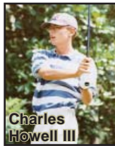
Charles Howell III